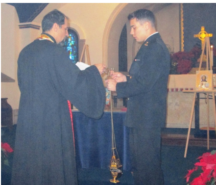
3: Akathist for St Nicholas at the U.S. Naval Academy

Because of your support, I can be on campus in the middle of the day to pray the Sixth Hour at the Naval Academy, hear confessions, meet for coffee with a midshipman or St. John's student in between classes, hold special services on campus—just as we did last week: the Nativity Paraklesis at St. John's, a beautiful preparatory service for the Advent season, and the strengthening Akathist to St. Nicholas on his Feast Day, 6 December, at the Naval Academy.