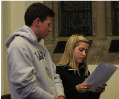
4: Akathist to St. Nicholas with Midshipmen at the St. Andrew Chapel, USNA

I want to thank you for valuing the difference for Christ that this ministry is making in the lives of the Orthodox students at St. John's College and the U.S. Naval Academy. I also want to use this opportunity to ask for your prayers: