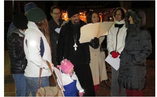
1: Caroling in Annapolis

I have much to report to you on our shared ministry to the college students of Annapolis! I say "shared" because your prayers and financial support of this ministry are a vital and indispensable participation in this ministry that is helping form these young men and women in the knowledge and love of Christ at St. John's College and the U.S. Naval Academy.