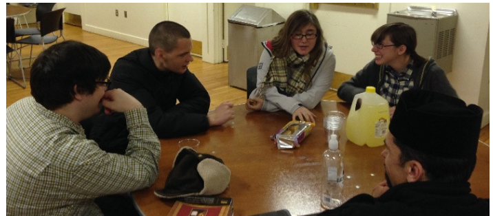
8: "Applied Orthodox Theology" Discussion Group at St. John's College—Applying the Faith to our daily lives!