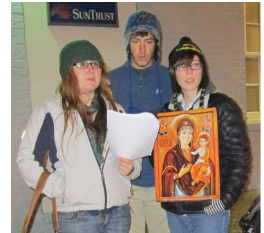
7: Caroling outreach in downtown Annapolis with St. John's students