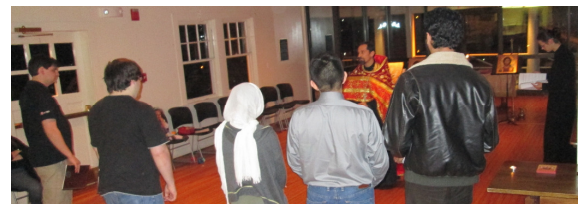
2: Nativity Paraklesis at St. John's College with some of those who participated